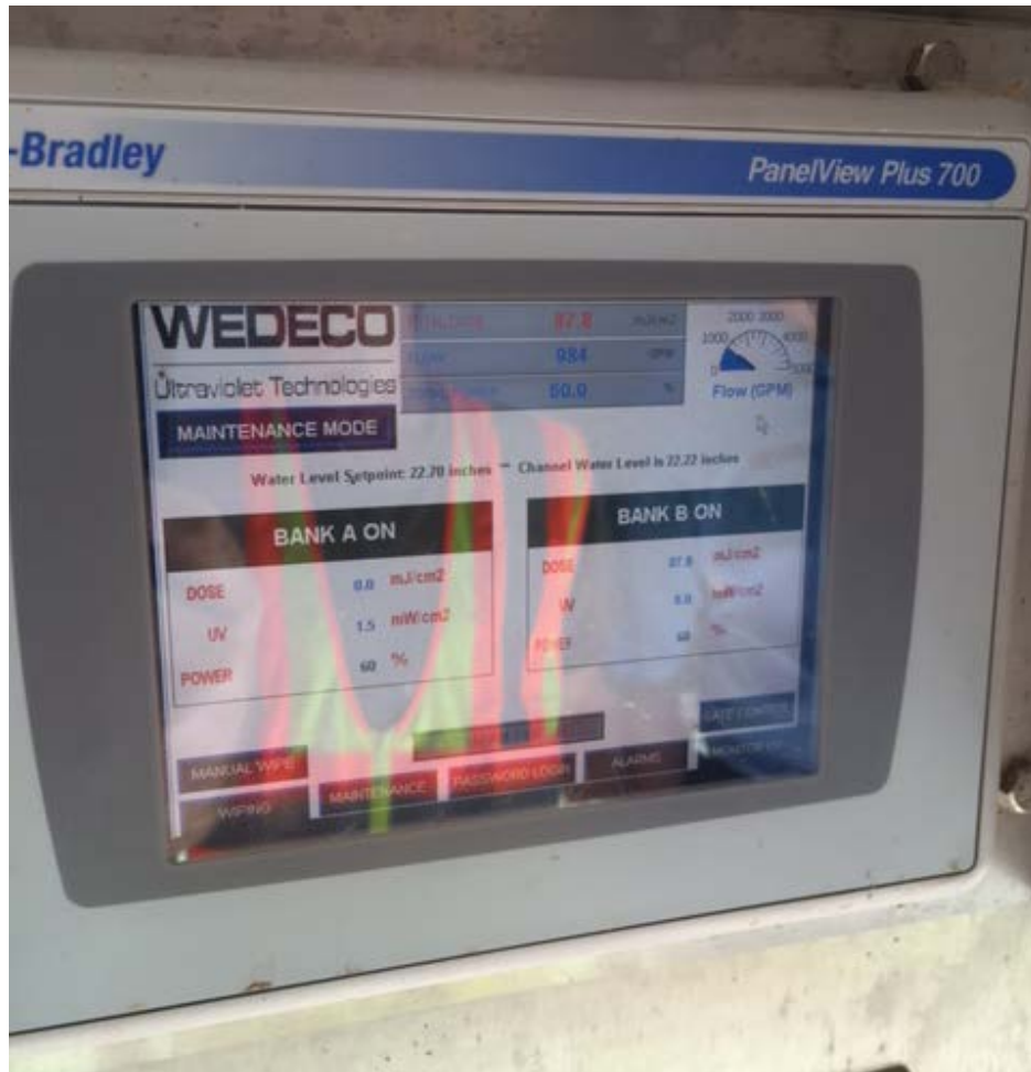
FIGURE 2.2 PLC USER INTERFACE

The Control Center for the Berryville WWTP UV Disinfection System is located adjacent to the disinfection basin and consists of a series of three control panels installed outdoor on a concrete pad and covered by metal carport type structure with metal siding. The central panel houses the PLC and various relays that control the operation of the system. The panels on either side primarily house the ballasts for the bulbs installed in each bank located in the Disinfection Basin. During normal operations, the electrical and controls equipment generates heat. Therefore, two (2) air conditioning units have been installed to maintain the temperature inside the panels within the proper operating range. Pictures of the Control Center cabinets and electrical/controls equipment are shown in Figures 2.2 through 2.5.